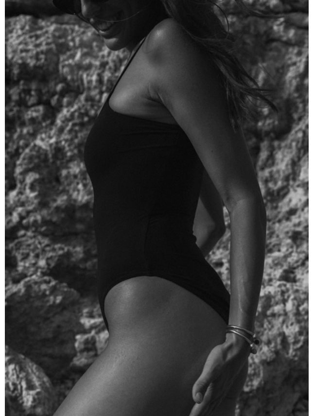
SCOOP NECK MAILLOT